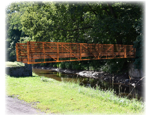
Image of proposed metal replacement bridge